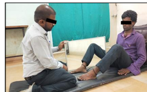
Fig. 7: Hip rotations with holds