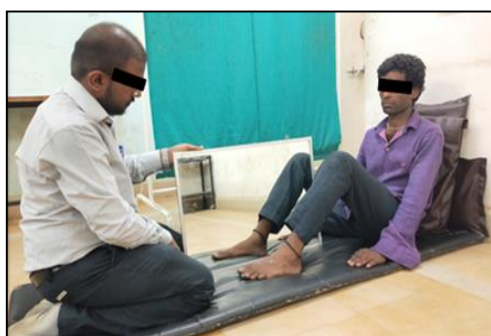
Fig. 6: Heel slides with holds