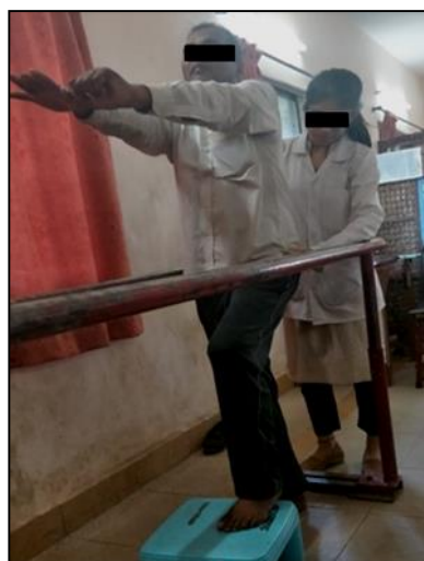
Fig. 3: Balance and Gait training exercises

In addition to this, the subjects in the Mirror therapy group received an exercise protocol to be performed by the non affected limb against the reflecting surface of the mirror for 15 minutes in long sitting position with the mirror placed between the two lower extremities. The mirror was held by