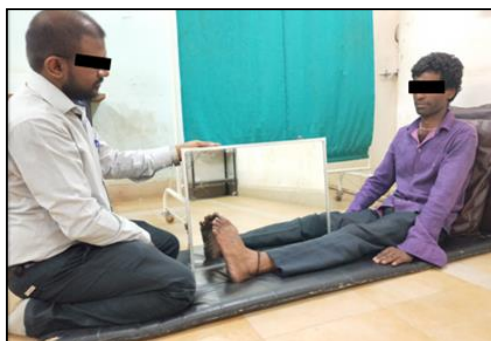
Fig. 5: Inversion- eversion