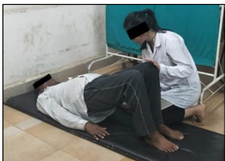
Fig. 1: Trunk strengthening

Patients in both the groups underwent patient specific institutional physiotherapy protocol for 6 days/week for a period of 4 weeks. It included trunk strengthening exercises (Fig. 1), upper and lower limb weight bearing exercises (Fig. 2), balance and gait training. (Fig. 3).