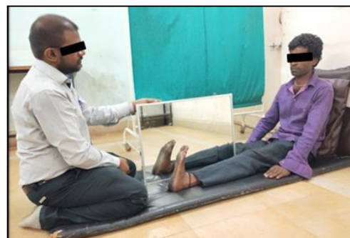
Fig. 4: Ankle Dorsiflexion-plantarflexion

the relative towards the paretic side to prevent the paretic limb from being viewed by the subject. For the mirror group, the reflective surface was kept facing the non-paretic limb. The exercises included ankle dorsiflexion-plantarflexion, (Fig. 4) inversion-eversion, (Fig. 5) heel slides with holds (Fig. 6) and hip internal and external rotation with holds (Fig. 7).