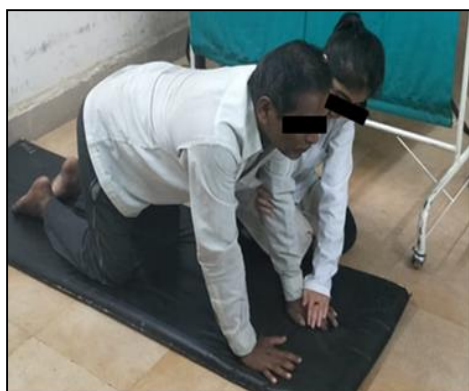
Fig. 2: Upper limb and lower limb weight bearing exercises