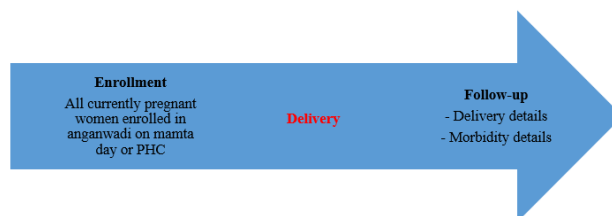
Fig. 2: Sample collection and follow-up

The questionnaire was developed after reviewing earlier validated and published questionnaires from the National Family Health Survey (NFHS) India. Public health and social sciences experts were consulted to better align the questionnaire with the objectives of our study. Pilot testing was carried out on 81 pregnant women to assess the feasibility of the study protocol and also the appropriateness and comprehensibility of the questionnaires. Errors identified during the pilot study were corrected to ensure consistency in the field.