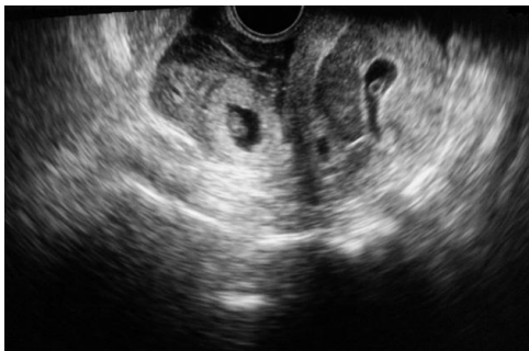
Fig. 1: Shows heterotopic and uterine pregnancy on trans vaginal sonography

with echogenic tissue around showing ring vascularity and burning ring fire sign present. There is evidence of mild free fluid collection in the pouch of Douglas. Seven years back one spontaneous vaginal history present. On examination, patient was haemodynamically stable, patient was posted for laparoscopy. pre operative and post operative injection 17 –oh progesterone acetate (proleutone) used and post operative tidilan injection also used, there is no proven evidence and guidelines about it but its use was only prophylactically Intraoperative findings there was signs of endometriosis and PID changes and left sided unruptured ectopic. Left sided laparoscopic salpingectomy was done. The material was collect in endobag and afterward sent it for histopathological examination which confirms trophoblastic tissue and presence of ectopic pregnancy.