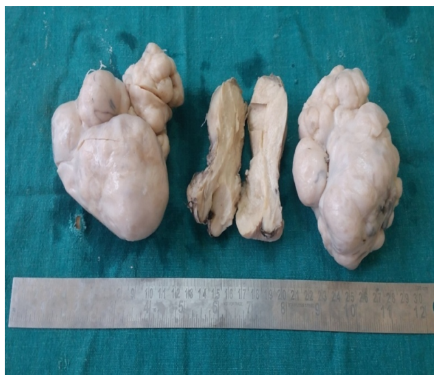
Fig. 1: Gross appearance of B/L ovary showing enlargement with multinodularity. Normal uterus, cervix

Metastatic carcinoid tumor to ovary is a very rare entity and CDX2 can be useful marker distinguishing pure primary ovarian carcinoid from metastatic GI carcinoid. However clinicopathological features including laterality, growth pattern, lymphovascular invasion and teratomatous components are important variables that should be taken in to consideration in case to case basis.