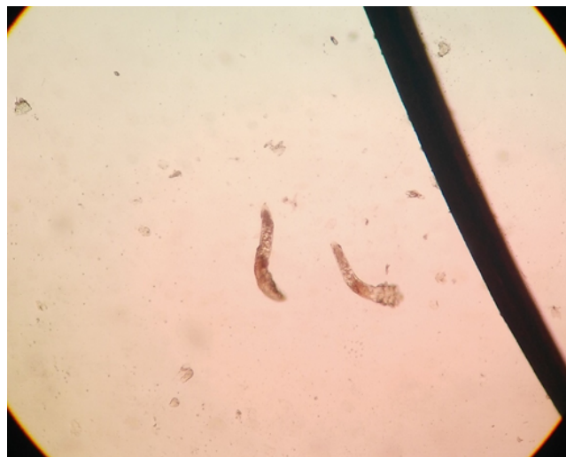
Fig. 4: Demodex mites near the shaft of lash