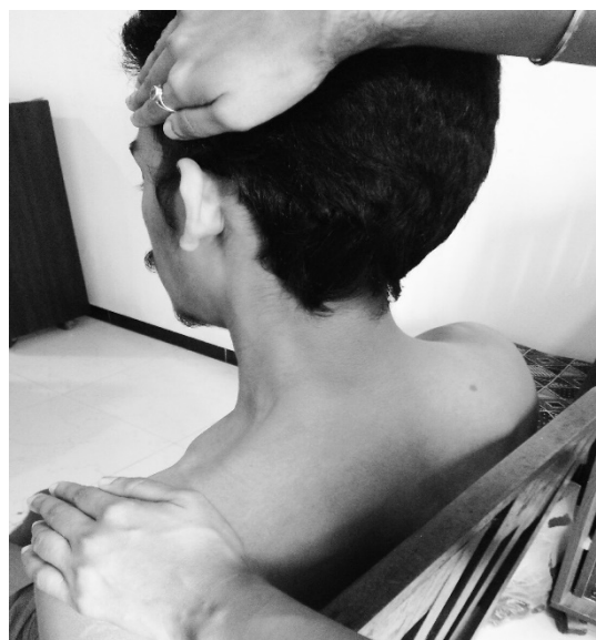
Fig. 4: Cryo-stretches