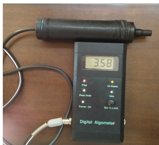
Fig. 1: Digital algometer

In the myofascial release group, the direct method of myofascial release comprised of 10 minutes. The fascia was palpated and pressure applied for 60-90 seconds. The procedure was carried out without sliding over the skin or forcing the tissue until the fascia complex starts to yield. The pressure was applied with the thumb while the patient lay in a supine position. Later the pressure was applied in supine lying by using the ulnar borders of hand. 9