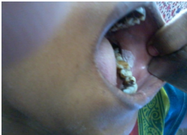
Fig. 1: Leukoplakia of oral cavity