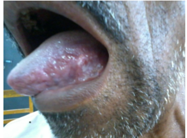
Fig. 3: Traumatic ulcer of tongue