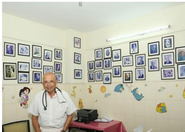
Pic 12: In his room with pictures