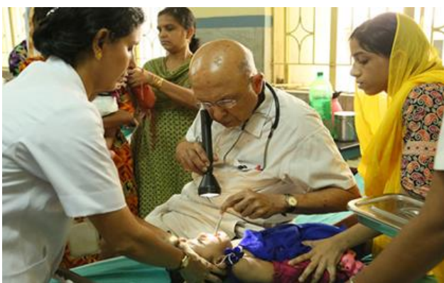
Pic 6: Bedside help