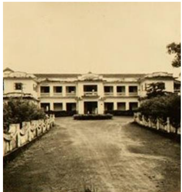
Pic. 1: An old picture of Jubilee mission hospital