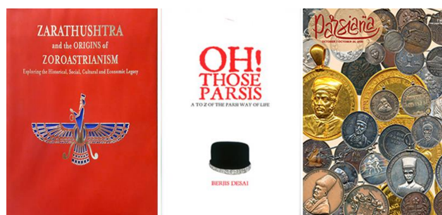
Pic 7: Some books and the magazine “Parsiana”

One periodical I found in the house was “Parsiana”, a magazine about and for the Parsi community. It disturbed me to see that only about 66,000 persons of this once thriving and prosperous community survived on that day (1996). I was interested also because one of my sister in laws is (was) a Parsi. One of the reasons for this decline could be that if a Parsi marries a non Parsi he/she is excommunicated from the fold and ceases to be a Parsi (This rule has finally changed). Due to their dwindling numbers and inter-marriages to keep the community pure, the community ended up having a lot of medical issues.