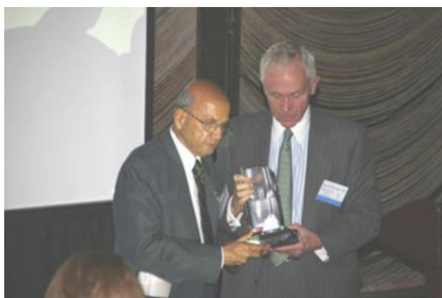
Pic 13 Receiving the Joseph McCarthy Award