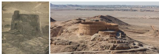
Pic 8: “The well of silence” in Iran (then and now)

Originating in Iran (Persia) some migrated to India. The bonds with the land of origin were never completely severed.