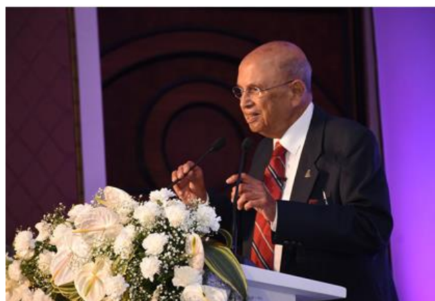
Pic 10: Delivering the oration at APSI meeting.