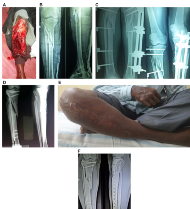
Fig. 2: A: Open Gr IIIB fracture; B: Radiological picture; C: with external fixation; D: Post operation with strips; E: Clinical outcome; F: follow-up at 24 months

100%. The time to union was 8–12 weeks in upper-limb open fractures and 12–36 weeks in lower-limb open fractures. PMMA vancomycin strips were removed 8–12 weeks postoperatively. Of 106 patients, two failed to follow up within two years. After two years, the patients returned with serous discharge and exposed strips at the distal tibia. (Figure 4a,b) These complications did not hamper a sound union within the specified time, however, and once the strips and implants were removed, the wound healed completely. No antibiotic- or implant-related local or systemic infection or acute wound infection was observed.