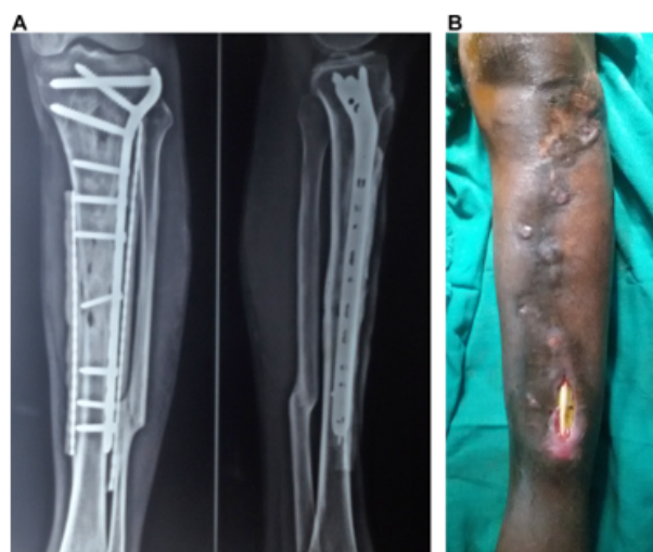
Fig. 4: Follow-up after 2 years. A: strips in united tibia; B: complicate to exposed at shin