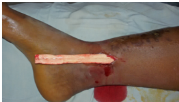
Fig. 5: Strip removal