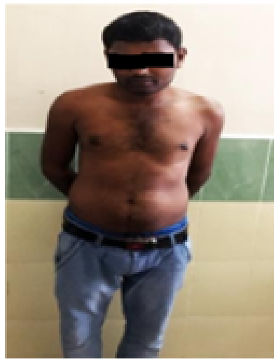
Shoulder internal rotation