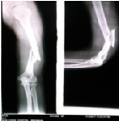
Preoperative Xray of Left arm AP. & Lat. view