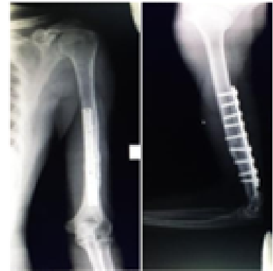
Follow up Xray of Left arm AP. & Lat. view showing sound union.