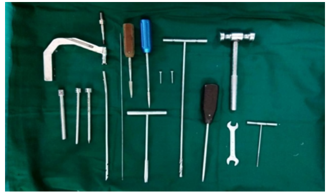
Fig. 3: Instruments and implants for nailing

Draping: The arm with the axilla is scrubbed, painted with Betadine solution and well draped.