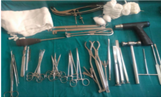
Fig. 1: Instruments required for plating

In case of nailing (Figure 3), the length of nail (24cm, 26cm, 28cm & 30cm) and diameter of nail (6mm, 7mm & 8mm), the number of proximal and distal locking screws required, are all assessed.