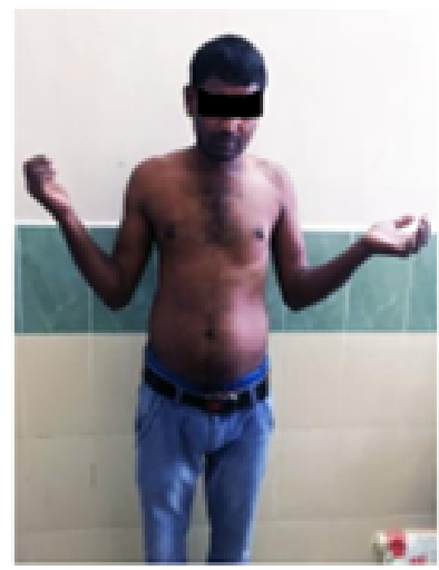
Shoulder external rotation