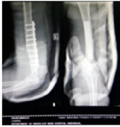
Post operative Xray of Left arm AP. & Lat. view.