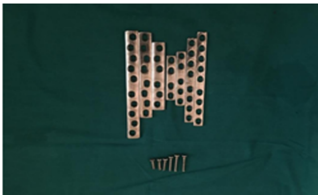
Fig. 2: Implants (DCPs and screws)

Anesthesia: All patients were taken up for surgery under General Anesthesia.