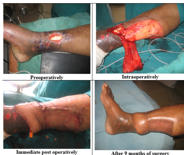
Fig. 2: Inferior based Fasciocutaneous flap for L3 rd defect

flap covers in compound fractures was to enable early union of the fractures and to minimise the morbidity and prevent complications like wound infection, osteomyelitis, shortening of limb and in extreme cases to prevent amputation of the limbs.