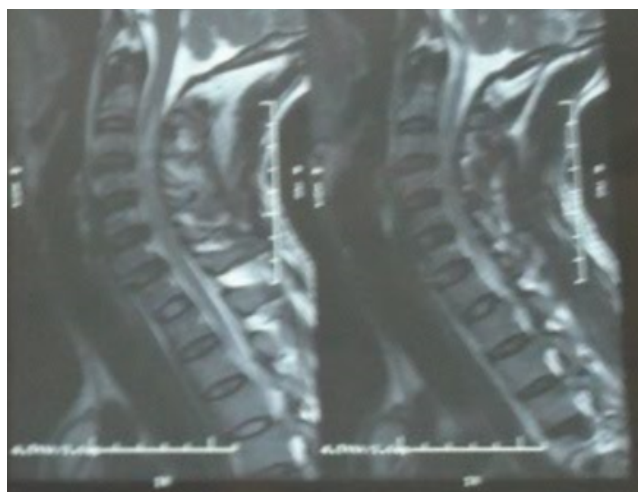
Fig. 1: MRI Cervical Spine of the patient showed a diffuse disc bulge with central disc protrusion at C3-C4 and C4-C5 level causing compression of the spinal cord with altered signal intensity within the cord.