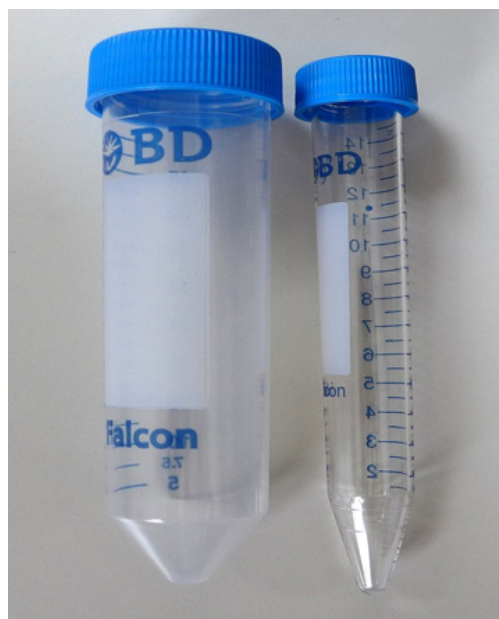
Fig. 1: Falcon tube