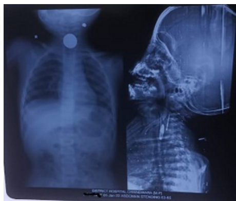
Fig. 2: FB in Cricopharynx (Coin)