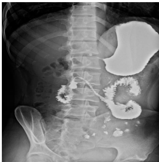
Fig. 2: Small sized stomach with smooth contours, loss of peristalsis and antral narrowing

Evidence of gross narrowing of pylorus of stomach with delayed passage of barium through the duodenum was noted (Fig. 3). Thus the diagnosis of benign stricture of the esophagus and corrosive stricture of antrum of stomach with linitis plastica type appearance of stomach due to corrosive poisoning was made.