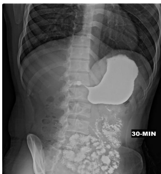
Fig. 3: Gross antral and pyloric narrowing and delayed passage of the barium contrast

Evidence of gross narrowing of pylorus of stomach with delayed passage of barium through the duodenum was noted (Fig. 3). Thus the diagnosis of benign stricture of the esophagus and corrosive stricture of antrum of stomach with linitis plastica type appearance of stomach due to corrosive poisoning was made.