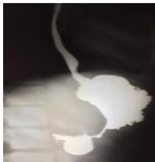
Fig. 5: Continuous filling of the esophagus and stomach suggesting involvement of the gastric esophageal junction

The barium swallow examination revealed smooth narrowing of lower third of the esophagus with minimal dilatation of the upper third (Fig. 4). No peristalsis was noted in the esophagus and there was no obstruction to the passage of the contrast in to the stomach. The study was extended to evaluate the stomach and duodenum, which revealed a small sized, contracted, aperistaltic stomach with presence of multiple ulcers at the greater curvature and gross narrowing at the gastric pylorus and antrum (Fig. 5 and Fig. 6).