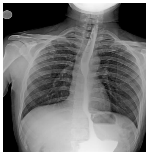
Fig. 1: Barium Swallow examination of Case 1

The barium swallow study revealed smooth narrowing of the lower half of the thoracic esophagus with minimal dilatation of the proximal segment. Visualized portion of stomach revealed complete effacement of gastric rugae (Fig. 1).