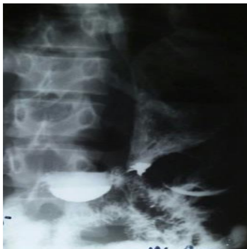
Fig. 7: Barium Meal examination of Case 3

The study revealed normal passage of barium through the esophagus with no narrowing or filling defects. The stomach was however, reduced in size with no peristalsis. The gastric mucosa was completely effaced with narrowing and ulceration at the antrum (Fig. 7).