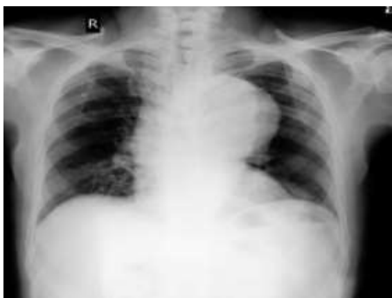
Fig. 1: X-Ray Chest PA view showing anterior mediastinal mass on left side

fraction of 68% on 2D echocardiography. CT AORTOGRAM (Fig. 2) done showed saccular aneurysm arising from arch of aorta distal to origin of the left subclavian artery, peripherally thrombosed, measuring 7.4 cm x 6.3 cm, enhancement of lumen on post contrast study measuring 5.3 cm x 3.8 cm and pulmonary arteries up to 4 th order showing normal opacification with no filling defect/thrombi noted within it.