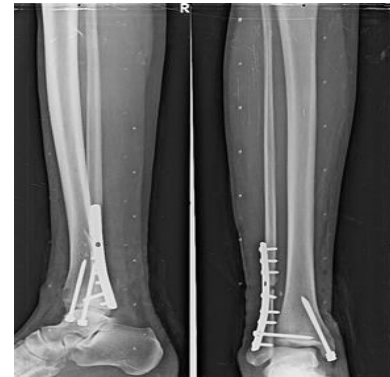
Immediate post-operative radiograph showing medial malleolar Screw with 1/3 semi tubular fibular plate and syndenmotic screw