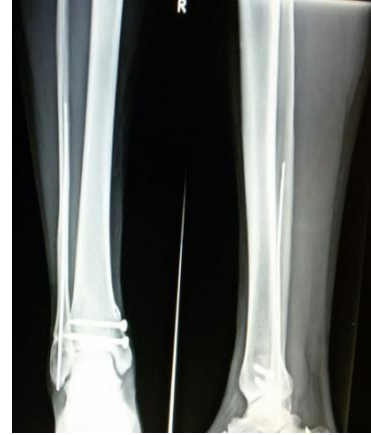
9 month follow up Radiograph