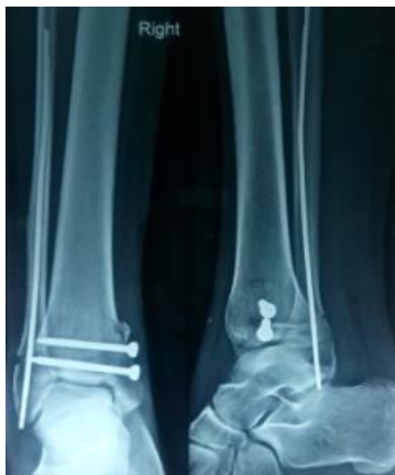
1 month follow up Radiograph