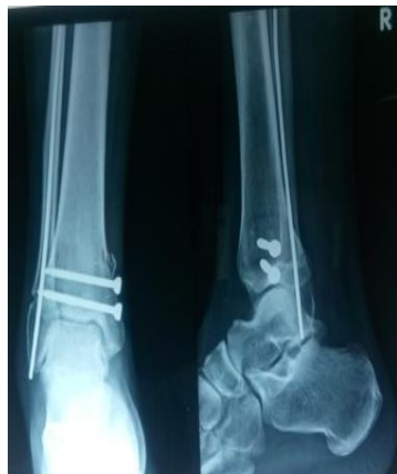
6 month follow up Radiograph