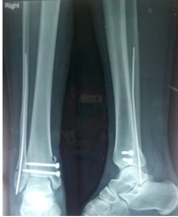
Immediate Post-operative Radiograph