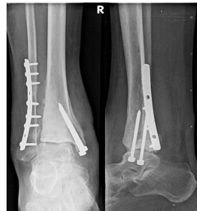
Nine month Follow-up Radiograph