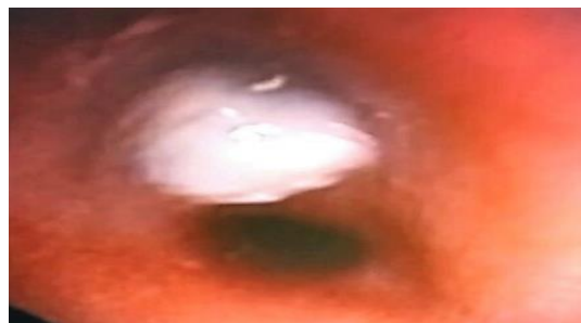
Fig. 4: Bronchoscopic view of left upper lobe completely obstructed with membranes of ruptured hydatid cyst

A video bronchoscopy of the patient was done with a flexible bronchoscope to visualize the left upper lobe. On flexible bronchoscopy the left upper lobe bronchus was seen to be completely obstructed with a folded handkerchief shaped white membranous tissue. This finding on bronchoscopy aroused a suspicion of a ruptured hydatid cyst and a review of the CT thorax report was asked for (Fig. 4).