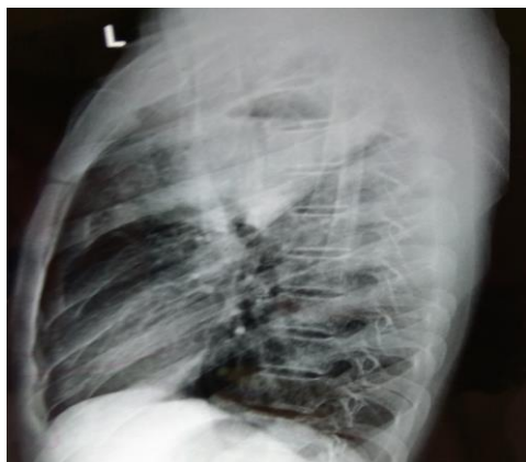
Fig. 2: Left lateral view of left upper lobe hydatid cyst

CT thorax with contrast reported a thick walled cavity with air fluid level involving left upper lobe. Surrounding ill defined heterogeneously enhancing areas of consolidation noted involving the left upper lobe with confluent nodular opacities. Significant volume loss of left upper lobe was also noted. Report concluded that findings were most likely suggestive of infective aetiology with lung abscess (Fig. 3).