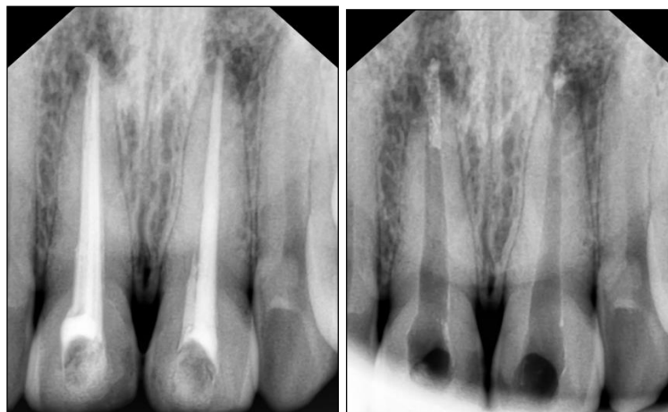
Fig. 3: Pre-operative IOPA gutta percha removal

Case 1: A female patient was reported with the chief complaint of pain and swelling in upper front region. On examination it was reported that the root canal treatment was done 2 years back. Radiograph findings, gutta percha was extruded beyond the apical foramen and periapical infection was seen. After the removal of gutta percha metapex dressing was given. Here are the radiograph images showing pre-operative and post-operative conditions.