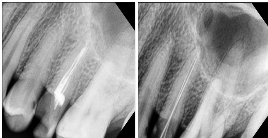
Fig. 5: Pre-operative IOPA gutta percha removal

percha was short in length and instrumentation of canals were inadequately done. Here are the radiograph images showing pre-operative and post-operative conditions.