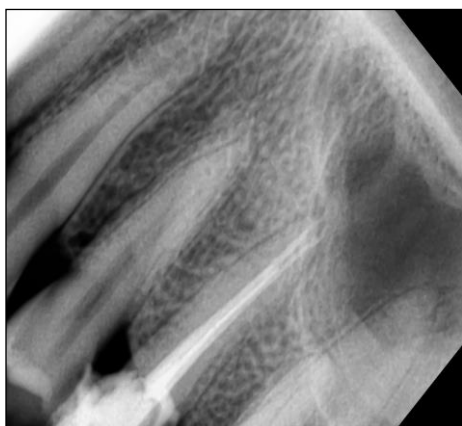
Fig. 6: Obturation