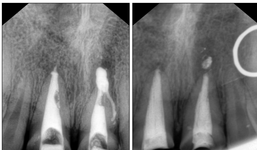
Fig. 2: Metapex obturation

Techniques of Endodontic Retreatment: For removal of gutta-percha as well as the new resin reinforced gutta-percha one can use heat and solvents (i.e., chloroform), LAAxes burs (Sybron Endo, Orange, CA), Gates-Glidden drills, and nickel titanium rotary files at a higher RPM (ie, 1200 RPM). With gutta-percha carrier systems such as Thermafil (Dentsply, Tulsa Dental, York, PA) in addition to the above