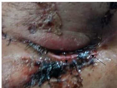
Fig 3. Lower lid with canalicular laceration

The eyelid was repaired surgically in layers. The lacrimal canal was repaired using the Teflon sleeve of a 22G Intrabath (Fig. 4). A fixation suture was passed through the tube and the eyelid skin with a 4/0 silk to prevent its extrusion. We located the proximal end of the canal and confirmed it by syringing. Both the canthi were reconstructed. Lower conjunctival fornix was reconstructed. The eye was patched and bandaged. The patient was prescribed with oral and topical antibiotics. The tube was left in situ and the wound was seen to be well approximated on the postoperative day 1. On 1 st follow up on postoperative day 7, the tube was in situ. We are waiting further for his follow up visit.