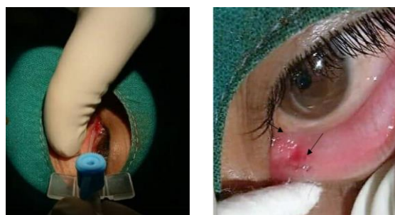
Fig. 2a: A 22-G angiocatheter tube passed; 2b: Plastic tube left in situ and cut through punctum