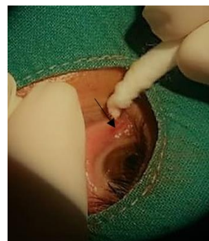
Fig.1: Lower punctum and canalicular laceration

The eye was patched and bandaged. The patient was prescribed with oral and topical antibiotics. The tube was left in situ and the wound was seen to be well approximated on the postoperative day 1. On 1 st follow up on postoperative day 7, the tube was in situ (Fig. 3). In the 12th week after the surgery, the tube was removed. The patient had a patent canaliculus on syringing.