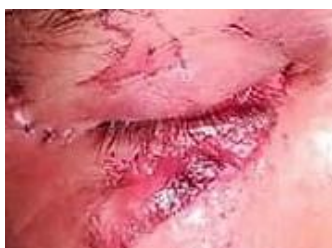
Fig. 5: Post-operative (Day 7) photograph