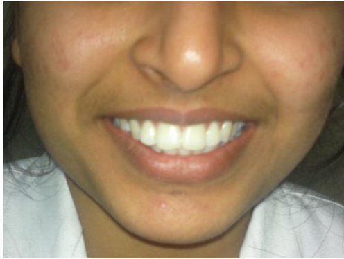
Fig. 1(c): Philtrum passing through left