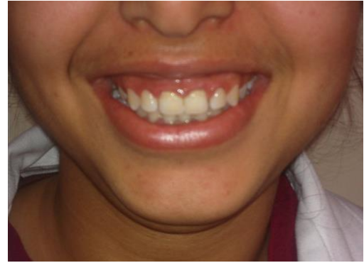
Fig. 2(b) Increased Bilateral negative space