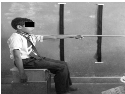
Fig. 1: Starting position for modified forward reach test

A stool with adjustable height was arranged near the wall, where child seated independently with back straight and feet pelvis width apart, touching the floor completely. A yard stick was arranged at the height of the shoulder of the child. Forward reach and lateral reach of the children were measured by asking the child to bend with his/her arm flexed at 90 degrees for forward reach and 90 degrees abduction for lateral reach 6 (Fig. 1-4). Three successive measurements were taken in centimetres. Mean of the three finding was calculated for each child. No unexpected responses or injuries occurred during testing.