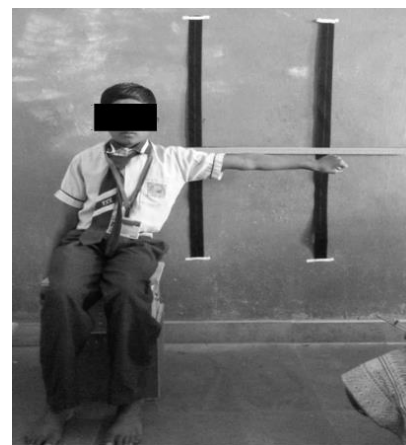
Fig. 4: End position modified lateral reach test