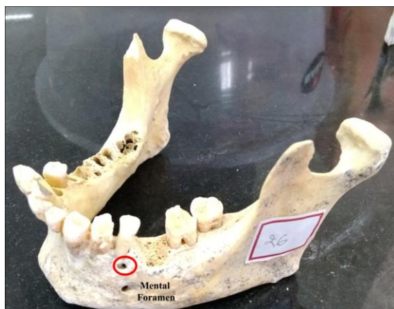
Fig. 4: Accessory mental foramen (circled) found antero-superior to main mental foramen near the canine root