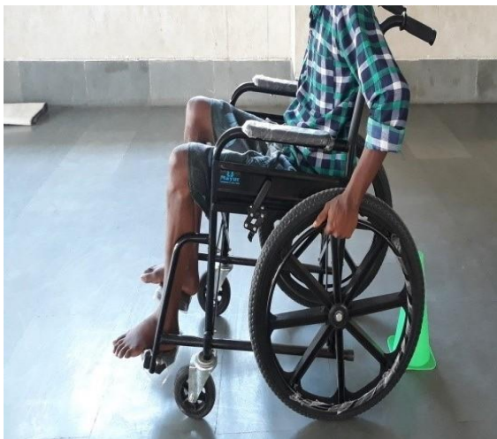
Fig. 1: Forward wheeling