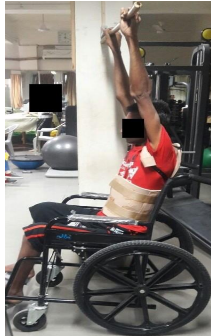
Fig. 3: Vertical reach

ramp was measured using a stop watch. 3. Forward vertical reach (Fig. 3): The wheelchair was positioned parallel to a marking board, and participants held the stick, independently (palms down). Participants were instructed to keep the stick level and to avoid excessive backward arching. The distance from the floor to the mark was measured in centimetres (cm). 4. One Stroke Push (Fig. 4) was taken with all 4 wheels of the wheelchair positioned on the carpeted or grass surface (1.5-cm pile); the participant propelled the wheelchair forward by pushing once with maximal effort. Once the wheelchair rolled to a stop, the most posterior point of the rear wheels was marked to indicate the completed distance pushed. If the push was asymmetrical, the mark was recorded for the most posterior wheel. The distance (cm) between the 2 marked points was recorded. This task was selected because wheeling on carpet or uneven surface is a common everyday activity requiring strong effective propulsion. Two trials for each task were taken and average score was recorded and documented. Maximum rest period of 30 seconds was allowed in between the test. All testing was completed without any incident and there were no complaints of fatigue during testing.