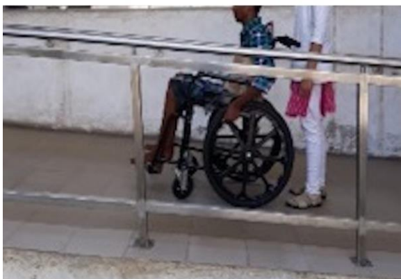
Fig. 2: Ramp ascending