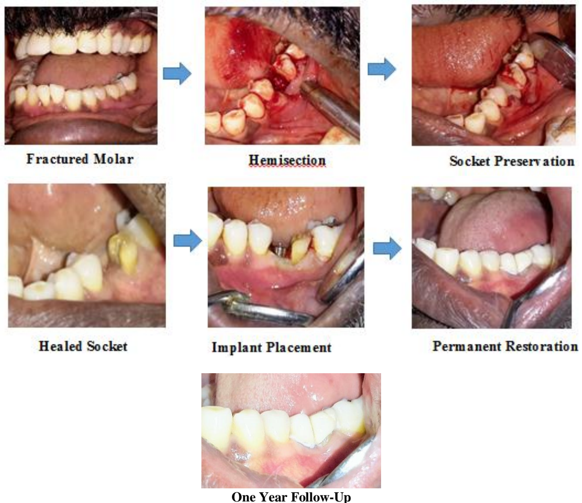
Fig. 1: Clinical Representation